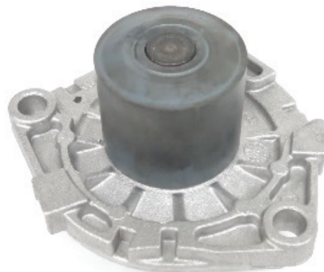
US8159 14 – 15 General Motors 2.0L OEM # 55488983

Please visit www.usmotorworks.com for detailed applications or contact customer service for further information.