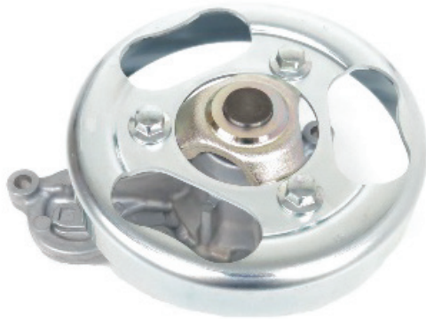
US8144 12 – 15 Honda 1.5L OEM # 19200-RW0-003