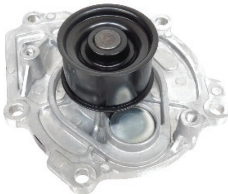
US8154 16 – 18 General Motors 2.8L OEM # 12645126