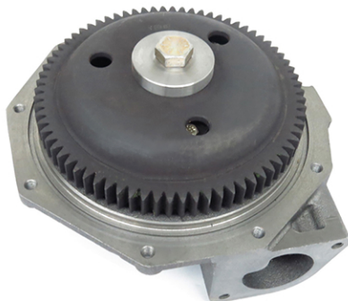
C15 Water Pump Part No: US6150 OEM: 1615719