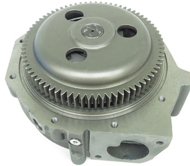
C15 Acert Water Pump Part No: US6342 OEM: 3362213