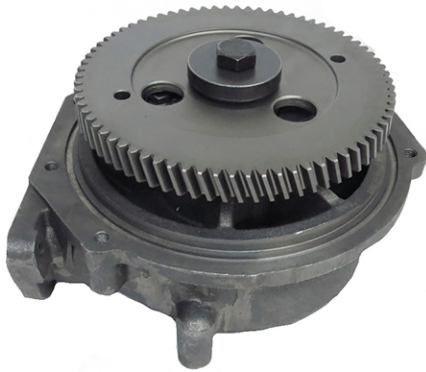
3406B/C Water Pump Part No: US2035 OEM: 7W7019