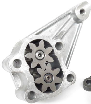
JOHN DEERE OIL PUMP Powertech 4.5L, 6.8L T, H High HP Part No: USOP4914