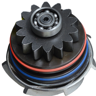
JOHN DEERE WATER PUMP PowerTech 6090 9.0L Tier 2 or 3 Part No: US303