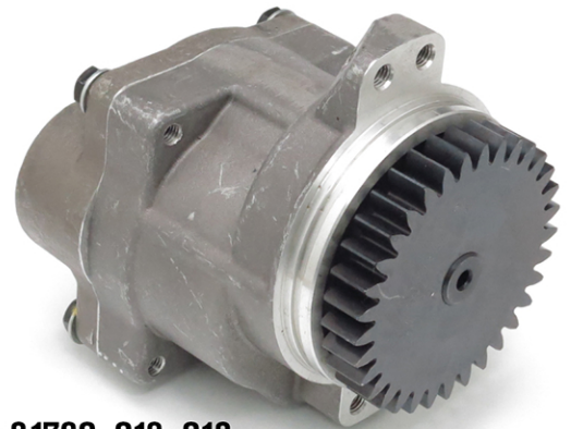
Caterpillar 3176C, C12, C13 Part No: USOP5220