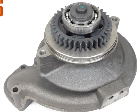
Caterpillar C13 Acert Part No: US95

All manufacturers names, numbers, symbols and descriptions are used for reference purposes only and in no way does it imply that any parts listed are the products of these manufacturers.